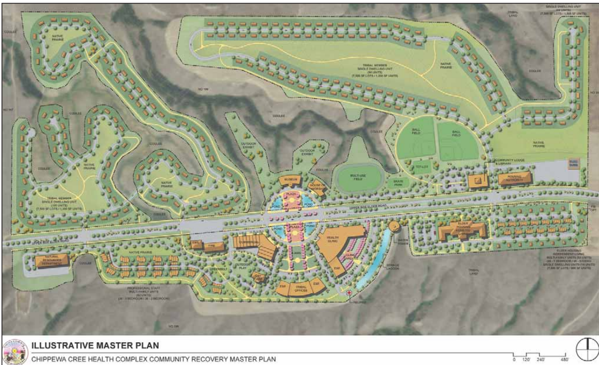
ILLUSTRATIVE MASTER PLAN CHIPPEWA CREE HEALTH COMPLEX COMMUNITY RECOVERY MASTER PLAN

The AHWCP will support you in achieving total abstinence from alcohol and other drugs and assist you in becoming a productive and responsible person in the community. You must be motivated to make this change and commit to an alcohol/drug-free life. This will be hard work on your part and a continuous commitment to your sobriety and recovery. You are worth the effort and we are behind you 100%. Our telephone number for contact is 395-4735 and our fax number is 395-5184. Drop in for a visit, we welcome you! Have a safe and happy holiday season.